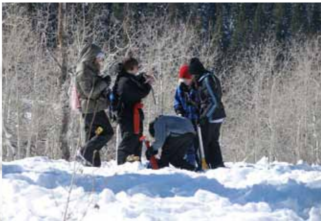
Students assemble avalanche rescue gear during a KBYG field session.

groups in Utah fit the bill and this year we became more involved with scouting, conducting several Saturday morning beacon and snowpack clinics. In addition to our evening presentations, we also presented the program to Scout leaders during round table discussions. This great conduit enables us to get our message to leaders who in turn scheduled the program for their groups. We were also invited to Scout-o-Rama, an event attended by 10,000 scouts state-wide, allowing us the opportunity to connect with more leaders, making inroads with a population that often isn't aware of our services. We anticipate that the impact of these talks will continue to grow with time as today's scouts begin to make decisions for their families and their own scout groups as adults.