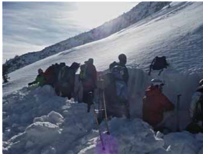
A group of Backcountry 101 students looks at the early season snowpack, getting a handle on why things will be so dangerous once it starts storming.

IN PARTNERSHIP WITH BRIGHTON SKI RESORT we continued the very popular Backcountry 101 program. A three hour evening class is followed by an on-the-snow field day giving side country users the basic skills they need to conduct a partner rescue, recognize avalanche prone terrain and safe route finding, identify weak layers in the snow pack and most important of all the keys to the kingdom- how to avoid avalanches all together. The results have been very positive and along with Brighton's Ski Patrol we're making great strides to connect with this fast growing segment of Utah's riding community. ❄️