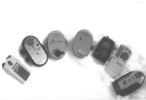
Figure 1: Beacons included in the Austrian test. l.t.r.: Pieps 457, Tracker DTS, Ortovox F1 classic, Ortovox F1 focus, Mammut Barryvox, Ortovox m2, Arva 9000.

Seven different types of beacons (Pieps 457, Tracker DTS, Ortovox F1 classic, Ortovox F1 focus, Mammut Barryvox, Ortovox m2, Arva 9000) were tested under comparable conditions in the laboratory as well as in the field. (see fig. 1)